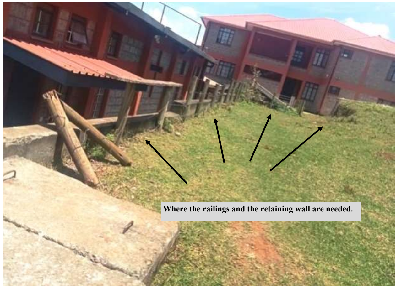
Where the railings and the retaining wall are needed.