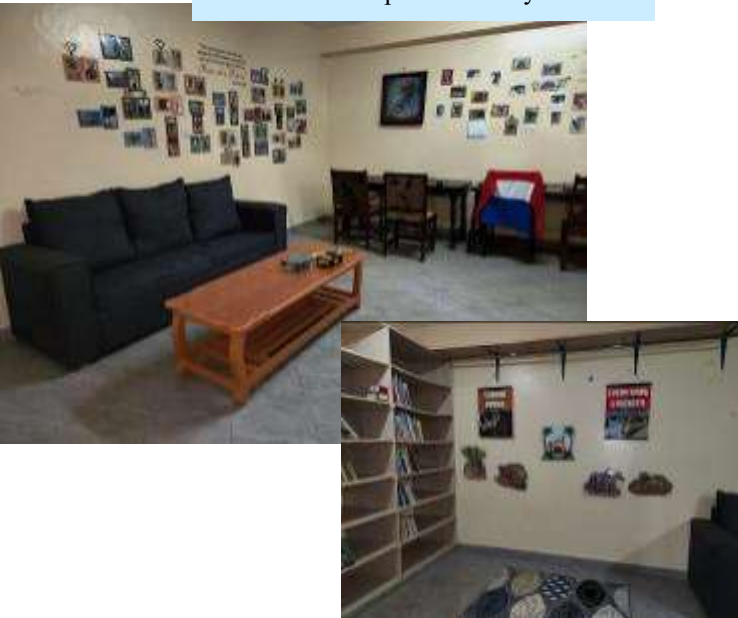
The improved library

We love and appreciate you!! Thank you for all you do. We could not do this without your prayers and support! (Little by Little makes a bunch)