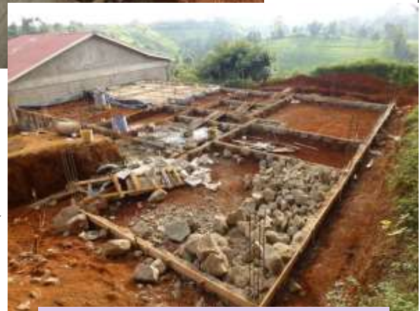
Foundation for building on top of basement

tion as well as furnish the 17' x 25' basement area and install a new septic system, which will meet our urgent need