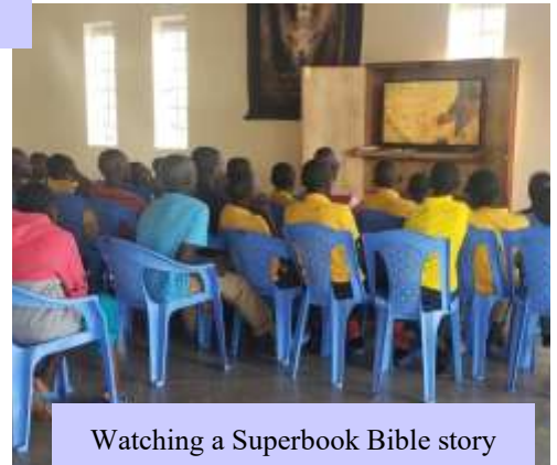
Watching a Superbook Bible story

When you choose to sponsor one of these children for $10 or more per month, you are changing a life forever!