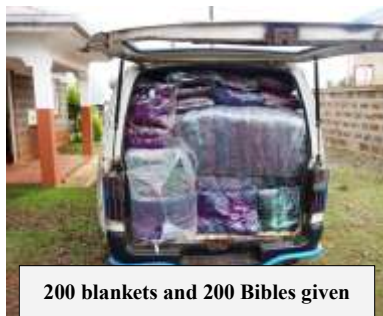
200 blankets and 200 Bibles given