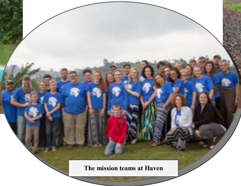
The mission teams at Haven