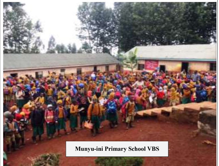
Munyu-ini Primary School VBS