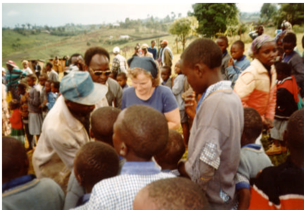
Passing out Bibles