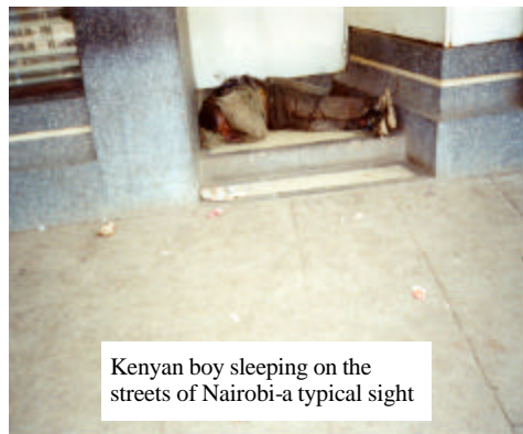
Kenyan boy sleeping on the streets of Nairobi-a typical sight