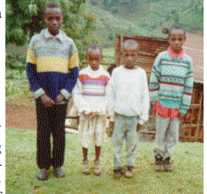
Two of these siblings got sponsored to attend school.

While visiting on this last trip, because of the love of Christ you showed in giving to sponsor children's education, 7 children were able to attend school. Pictures of the children will be sent to those that asked for their donation be used for education sponsorship. I wished you could have been there, because