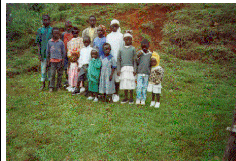
These children are awaiting sponsors.

I don't know the words to describe the smiles, tears, and love on the faces of the families you touched by your sacrificial gifts. Thanks for giving children a hope for a better future.