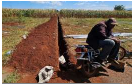
Pipes between borehole and tanks

We hit water!!!! Feb. 13, 2025. Praise the Lord!!!