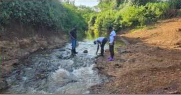
The dirty river water, where community gets water