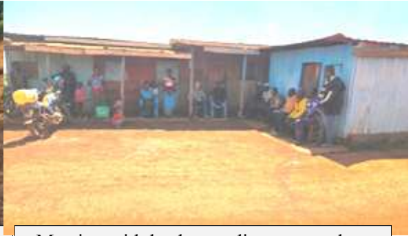
Meeting with leaders to discuss our plans