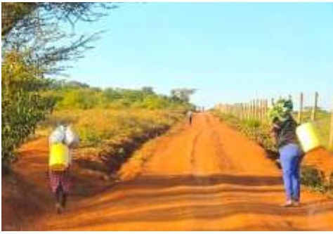
Teenage girls carrying water from river