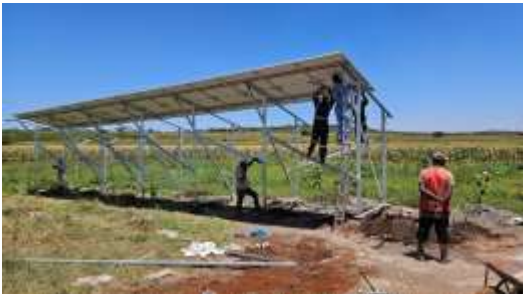
Installing the solar panels to pump water