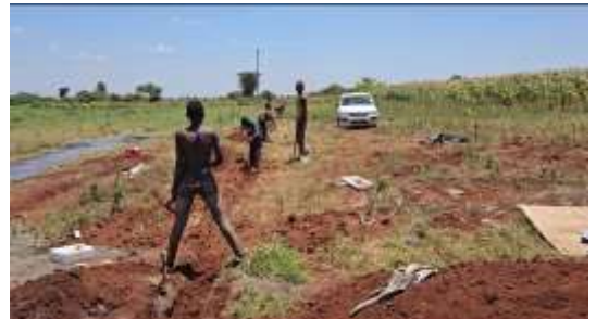
Trench to the public access to the water