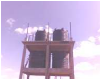
Tanks for 40,000 liters storage