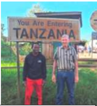
Lawrence and me stopping to see the Tanzania border