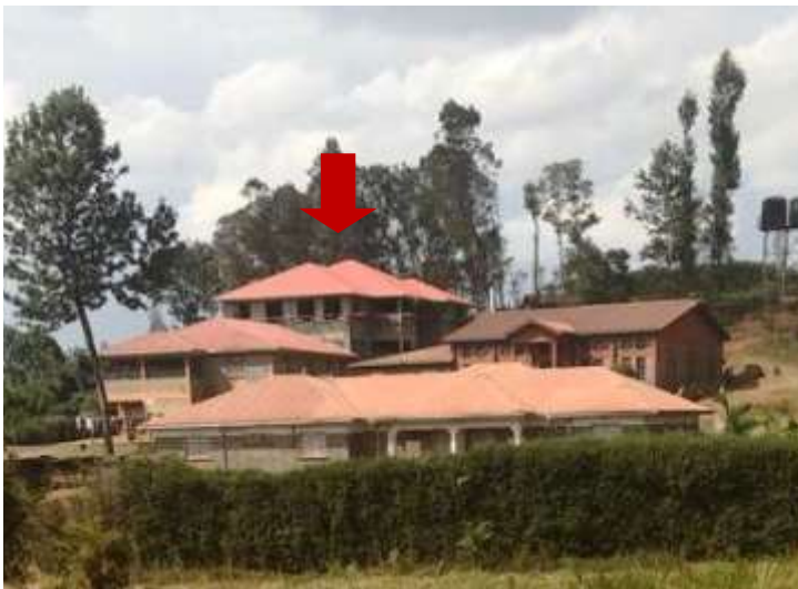
The newly installed roof on the new building

The next phase is installing the doors, windows and stair railings as the Lord provides (see chart on back.) The primary purpose of the upper floor is to provide a place for visiting mission teams to stay, while spreading the love and salvation of Jesus to the community.