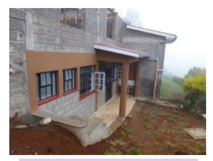
Finished basement apartment for our growing boys

The walls of the ground floor are completed and the concrete superstructure is being poured. Once that is complete, and funding arrives, the finishing of the ground floor, inside and outside, can be started and, when finished and furnished, the ground floor will be ready for use. (See reverse side for building progress and funding status.)