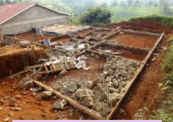
Foundation for building on top of basement

tion as well as furnish the 17' x 25' basement area and install a new septic system, which will meet our urgent need