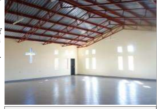
Inside of the Dinning/Meeting Hall

Also, to put the hall to further use, on to our sewing ministry. We are in the