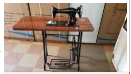
One of the 6 machines we plan on purchasing for our sewing ministry.

ing machines and allow ladies from the surrounding areas to be trained how to sew, one person per machine. This will enable them to support and pay for their children's education. After they have learned how to sew we will