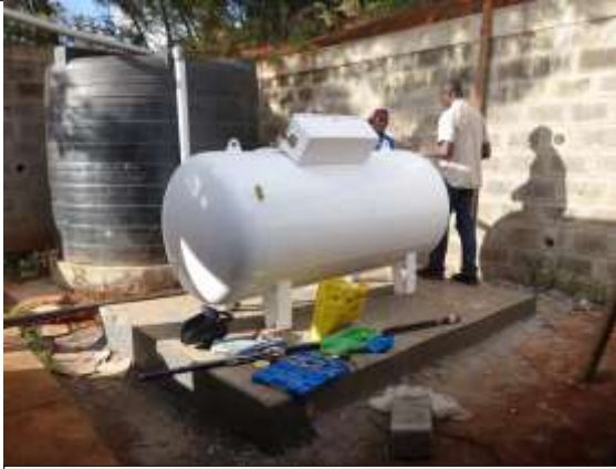
Our 1 ton (521 gallon) LP Gas tank behind the kitchen

In November, installation of LP Gas into our kitchen began. Currently, the contractor is waiting on some part to be imported in order to complete the piping into the kitchen. We expect this to be complete