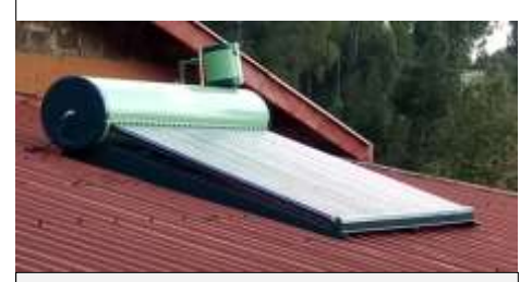
Solar Water Heater

the inside. We expect to use this building for much ministry.