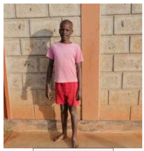
Tyson in 2018.