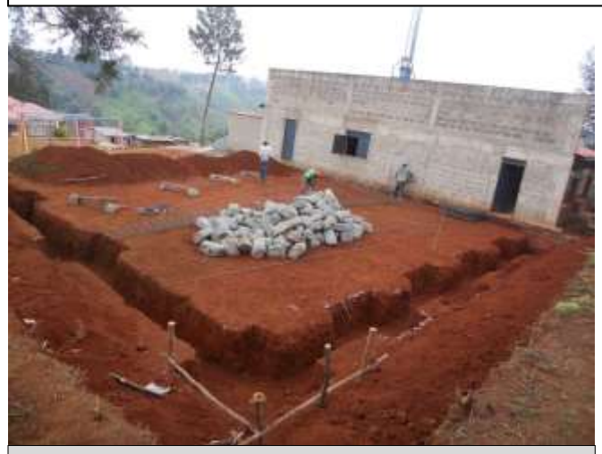
This is the beginning of the multi-purpose building.

Also, after two years of waiting, the 10 feet tall retaining wall, designed to stop soil from piling up into the back yard of our kitchen when it rains, has been completed!