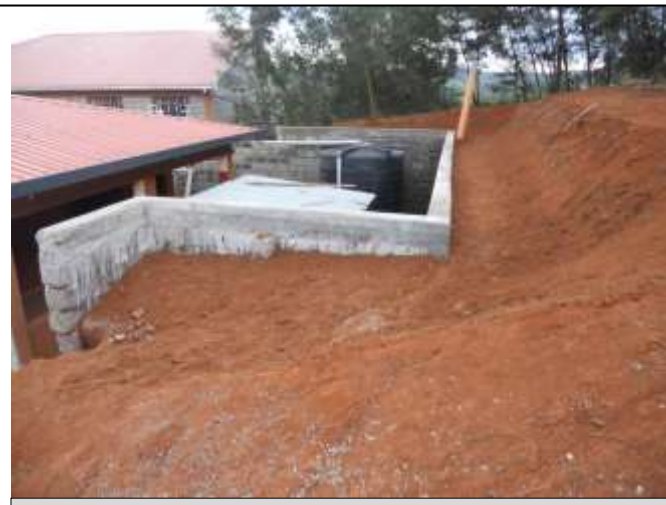
The completed retaining wall behind the kitchen.