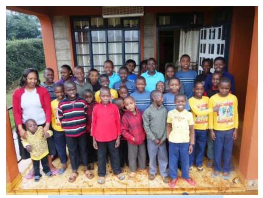
When you choose to sponsor one of these children you are changing a life forever! www.throughthestorm.org/children.php.

www.throughthestorm.org tsm@throughthestorm.org www.facebook.com/HavenOnTheHill