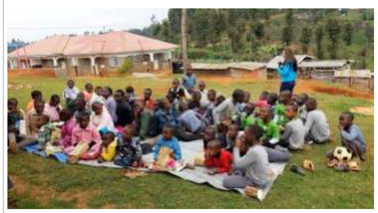
We love and appreciate you!! Thank you for all you do. We could not do this without your prayers and support! (Little by Little makes a bunch)

Thank you The Plans HE Has For You Ministries team! You made a difference.