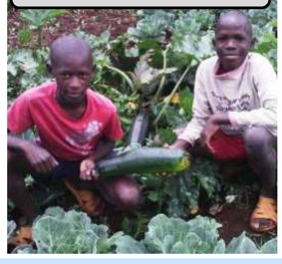
When you choose to sponsor one of these children you are changing a life forever! www.throughthestorm.org/children.php.