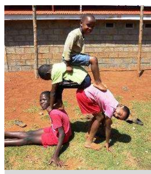
Some of our boys getting creative.