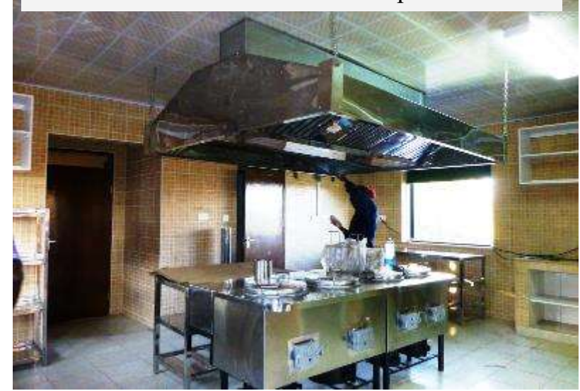
New Kitchen - almost completed!