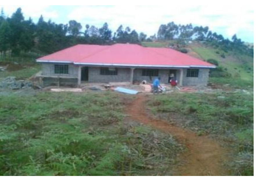
LOOK AT WHAT THE LORD HAS DONE, 2007!!!!!

Little by little makes a bunch. You have been prayed for today!