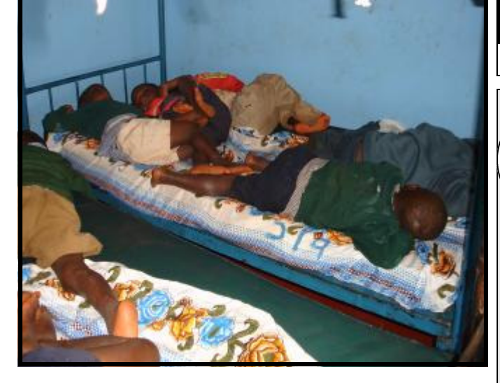
difference the love of Jesus makes!