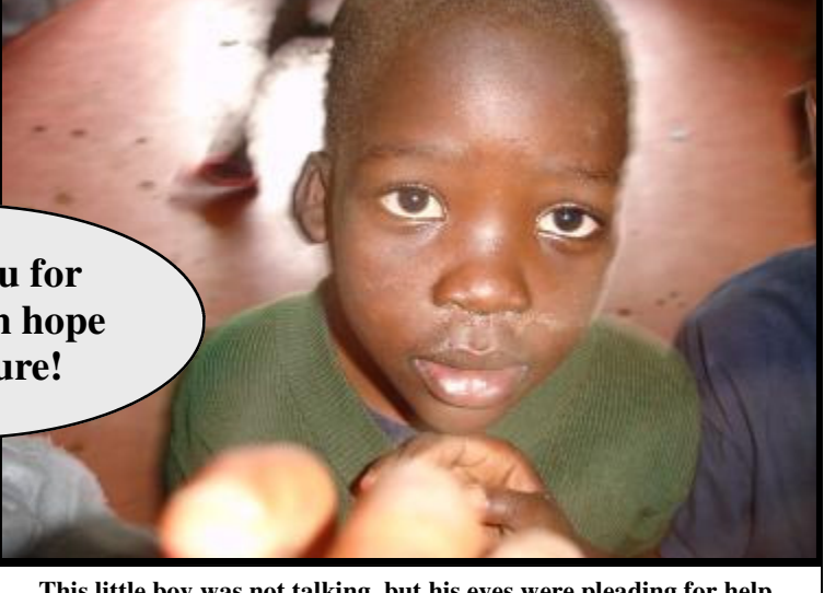
This little boy was not talking, but his eyes were pleading for help.