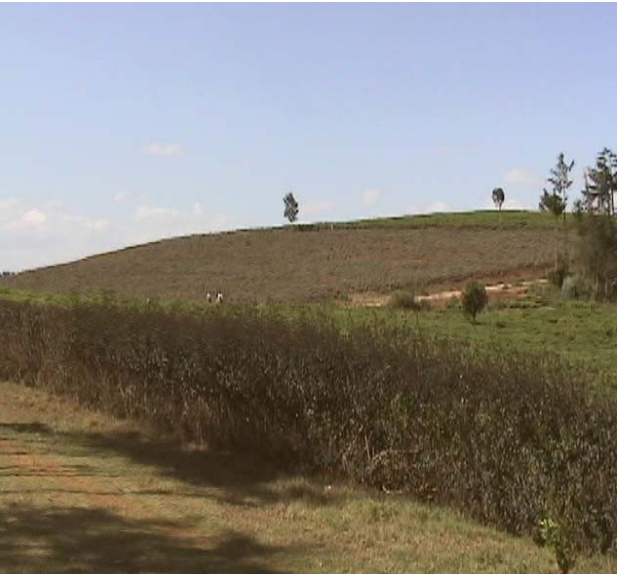
8.3 acre orphanage site in Gatundu, Kenya in background. Deeded to Through the Storm International NGO