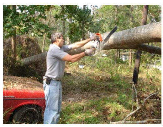
Sawing trees for Jesus

portunity for prayer! The house was creaking and shaking, trees were falling and I could hear at least 3 tornadoes in the distance. Praise God for his hand of protection over the community ! The next morning I went out into the community and had a "chainsaw party" clearing trees off the roads and visiting with those displaced from the Trinity River Bottoms. Phil