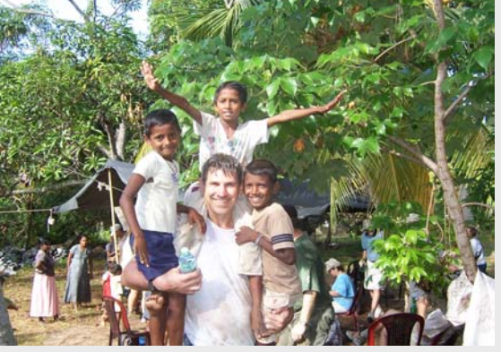
Sri Lankan kids climbing on Phil

Our next trip to Kenya is planned for January 2006. We plan on meeting with our architect and contractor to start building process. PRAISE THE LORD!!! We are collecting jackets for children (all sizes). The children ask for them because it gets cool in the Gatundu area.