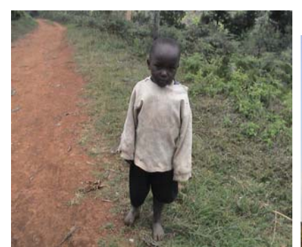
Orphaned boy. We gave him shoes, clothes & love

portunity for prayer! The house was creaking and shaking, trees were falling and I could hear at least 3 tornadoes in the distance. Praise God for his hand of protection over the community ! The next morning I went out into the community and had a "chainsaw party" clearing trees off the roads and visiting with those displaced from the Trinity River Bottoms. Phil