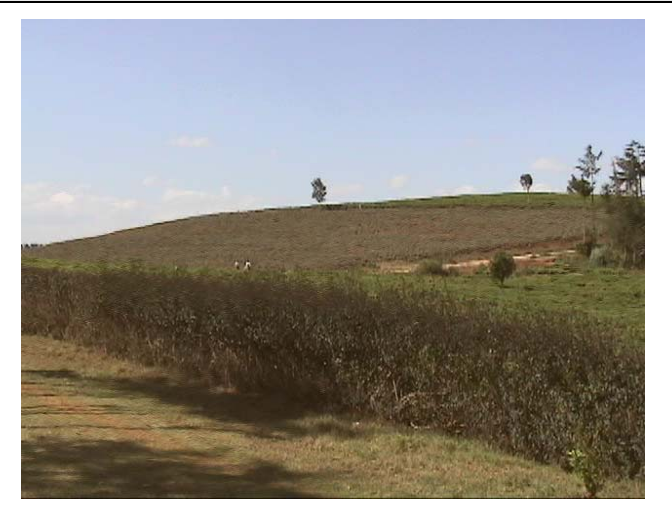
Potential 6 acre orphanage site in Gatundu, Kenya