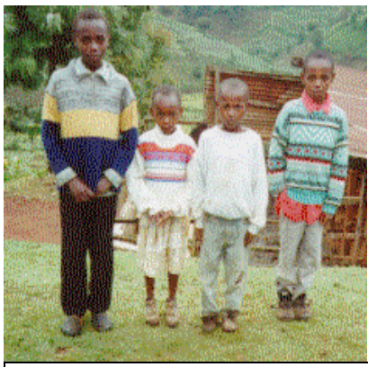
Two of these siblings got sponsored to attend school.

While visiting on this last trip, because of the love of Christ you showed in giving to sponsor children's education, 7 children were able to attend school. Pictures of the children will be sent to those that asked for their donation be used for educa-