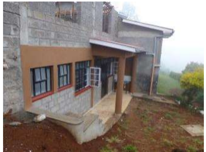
Finished basement apartment for our growing boys

The walls of the ground floor are completed and the concrete superstructure is being poured. Once that is complete, and funding arrives, the finishing of the ground floor, inside and outside, can be started and, when finished and furnished, the ground floor will be ready for use. (See reverse side for building progress and funding status.)