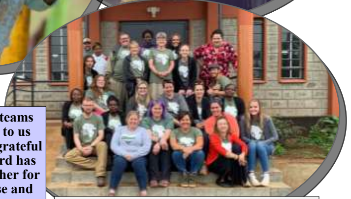
The Plans HE Has For You Ministries

These two teams are family to us and we are grateful that the Lord has put us together for His purpose and plans.