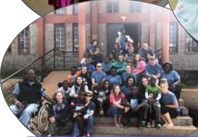
IWM Team with Haven Family

These two teams are family to us and we are grateful that the Lord has put us together for His purpose and plans.