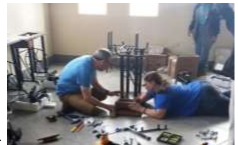
The machines had to be assembled

Sewing Ministry: From the planning stages to reality! We have purchased and assembled 6 sewing machines! Thanks to you (our partners!) Five ladies and one man have been selected based on their need and will be taught how to sew! We have help for them to sell their finished products, which will provide the means for them to purchase their sewing machine and take it home to start their own business!