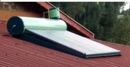
Solar Water Heater

the inside. We expect to use this building for much ministry.