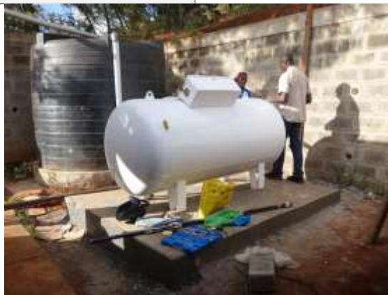
Our 1 ton (521 gallon) LP Gas tank behind the kitchen

In November, installation of LP Gas into our kitchen began. Currently, the contractor is waiting on some part to be imported in order to complete the piping into the kitchen. We expect this to be complete in January. The goal is to eliminate the need to burn firewood.