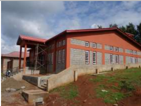
Dinning hall/ community center is now days from completion!!

Our dining/meeting hall is very close to completion. The floor tile has been laid and grouted. All that remains is to finish painting, install electrical fixtures and furnish