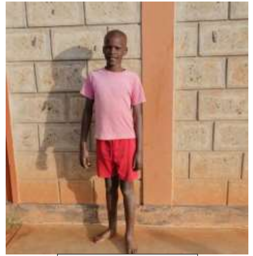
Tyson in 2018.