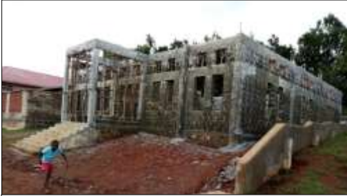
Dining/Meeting Hall walls completed. Ready for the roof to be put up.

By the time most of you read this, I will, the Lord willing, be in Kenya for the beginning of a two month stay. The plans for the month of June are to put the roof in place on our new Dining/Meeting Hall, move the solar panels to