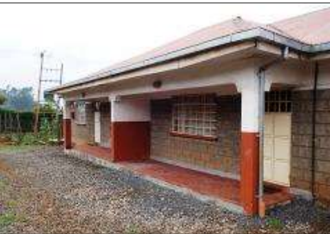
The repaired and resurfaced verandas

Much of the wall and drainage design had to be done on the fly. It was the rainy season, which made it easier to design the drainage because we could observe where the rain water was going to and identify areas we needed to pinpoint for erosion control.