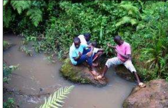
Some of the boys fishing at the river

We love and appreciate you!! Thank you for all you do. We could not do this without your prayers and support! (Little by Little makes a bunch)