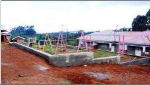
Retaining wall protecting the playground

It was a trip packed with activity. My primary purpose of going was to oversee the construction of retaining walls and drainage being put in place in preparation for the Dining Hall building.