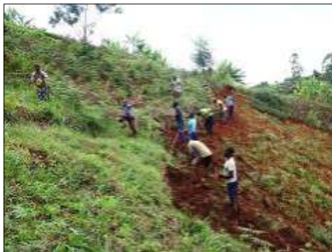
Men and boys plowing the Shamba

We also did a lot of work on our Shamba (farm), including expanding our farm to an area we had previously left dormant. This was made feasible by the fact that our boys are growing and are a great help on the Shamba. They love to work and it is a pleasure working together with them!