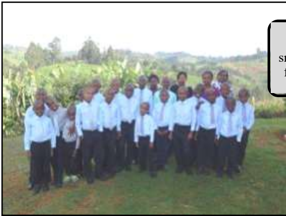
Boys looking smart while going for competition.