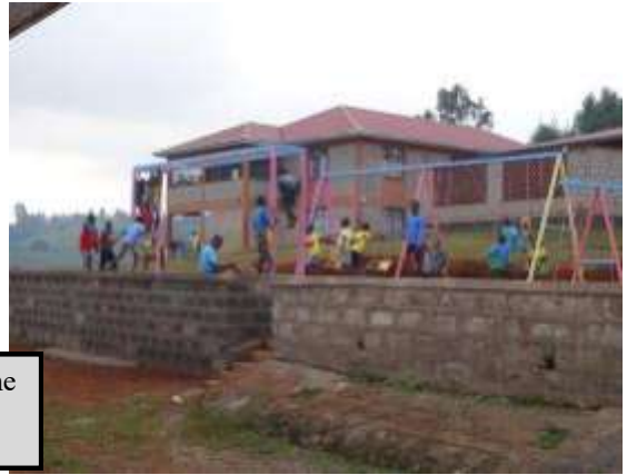
Enjoying the new