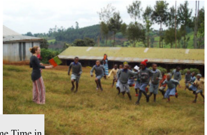
VBS Game Time in Kenya