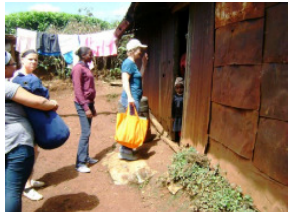
Ministered the love of God by visiting our neighbors' homes with clothes, Bibles and prayer.

We love and appreciate you!! Thank you for all you do. We could not do this without your prayers and support! (Little by Little makes a bunch)