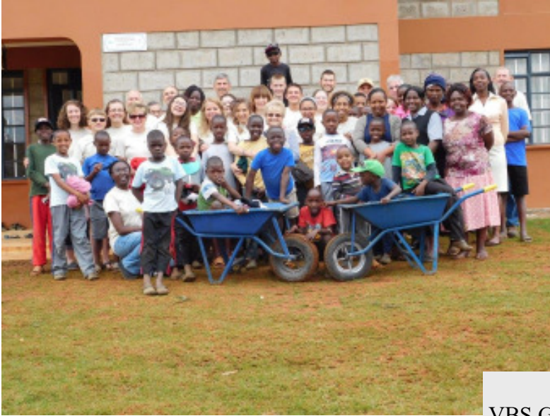
Left: The Inheritance World Ministries team and the Haven on the Hill Family August 2015