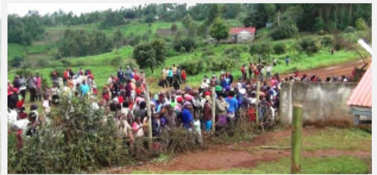
Gave clothes to over 600 people from the Haven community.