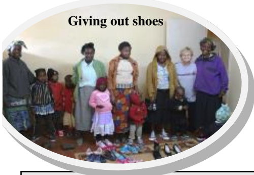
Giving out shoes