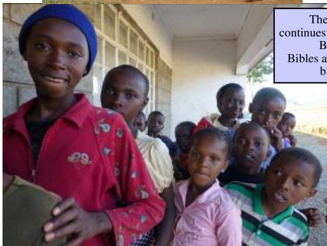
The community continues to receive God's Blessings! Bibles are among those blessings!