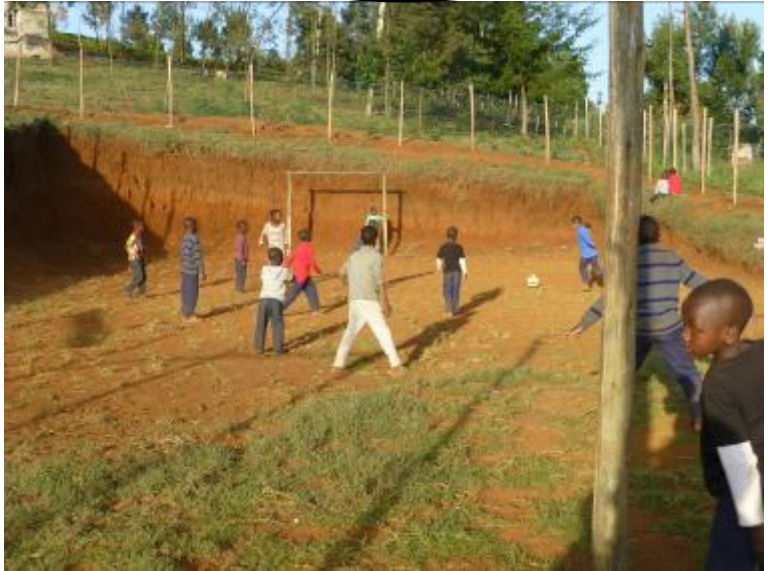
Haven's Football Field. A safe place for the community children to play.