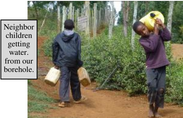
Neighbor children getting water. from our borehole.