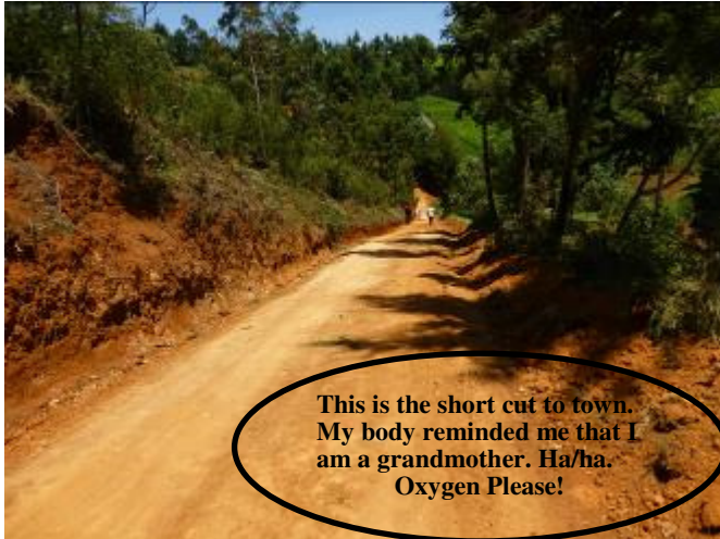
This is the short cut to town. My body reminded me that I am a grandmother. Ha/ha. Oxygen Please!