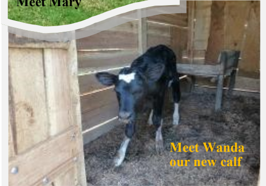
Meet Wanda our new calf

We now have 2 cows, 2 female calves and 1 male calf.