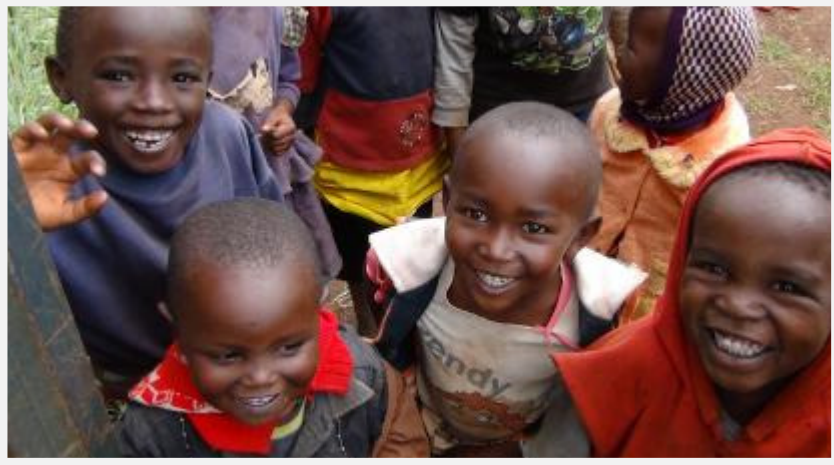
Neighborhood friends that come to play at the Haven on the Hill.

About Through The Storm Ministries The mission of Through The Storm Ministries (TSM) is to minister the love of God by providing assistance for individuals through unexpected, extraordinarily difficult times in their lives. This includes the preaching of the Gospel of Jesus Christ. ( Mat 25:35 ) and visiting the fatherless and widows in their affliction ( James 1:27 ) We are committed to remaining debt free. ( Rom 13:8 ) TSM is registered as a non-profit organization according to Section 501C(3) of the Internal Revenue Code. All donations to TSM are tax deductible. TSM operates as Through The Storm International in the nation of Kenya as a non-governmental organization (NGO).