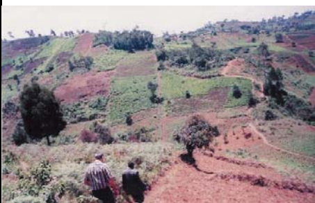
Land site for future orphanage

In our last communications to you we had felt that we were days away from receiving the 99 year lease for the 5 acres of land for the orphanage site. We have learned that the paper containing the district land map had been "lost" for at least a month and that had delayed the process. Here is the status of the progress of the land grant as of 12/1/01: