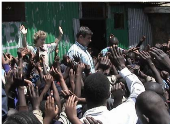
Children accepting salvation

Because of your giving, each child received a pair of shoes or a Bible. What a joy there is in showing God's