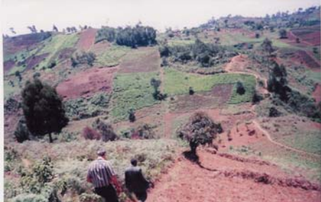
Land site for future orphanage

Praise the Lord!!! Much has happened since our last newsletter. Before we left for Kenya we received word that our Non-Governmental Organization (NGO) status had been approved. Now Through The Storm International is recognized throughout Kenya as a legal entity. Most important, we are now able to take possession of land.