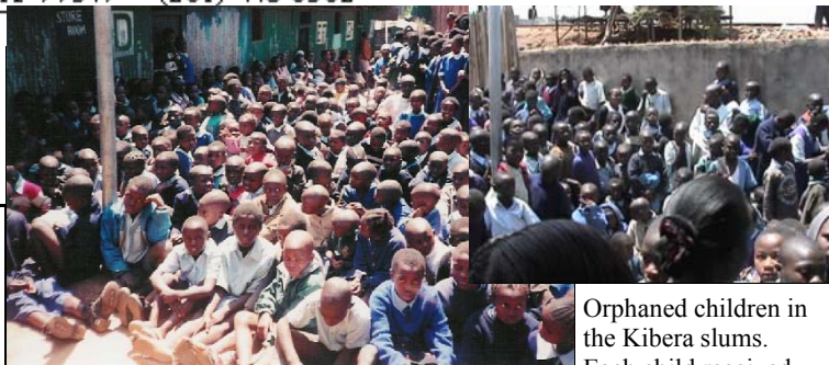
Orphaned children in the Kibera slums. Each child received shoes or a Bible.

Kibera is a community in Nairobi of more than 1 million people crowded into a small area. The "streets" are dirt, mud & craters with waste water flowing in them. Almost none of the homes have plumbing or electricity. The homes are made of mud or "tin" with, typically, no windows. Diseases, including a 70% HIV infection rate, are rampant.