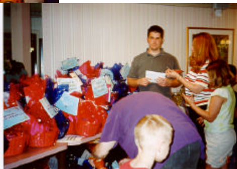
Ministering and giving baskets to residents of the Green Acres nursing home.