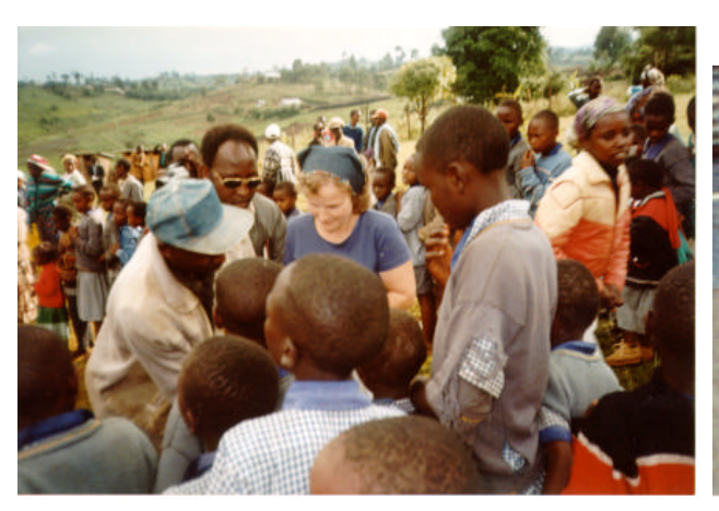
Passing out Bibles